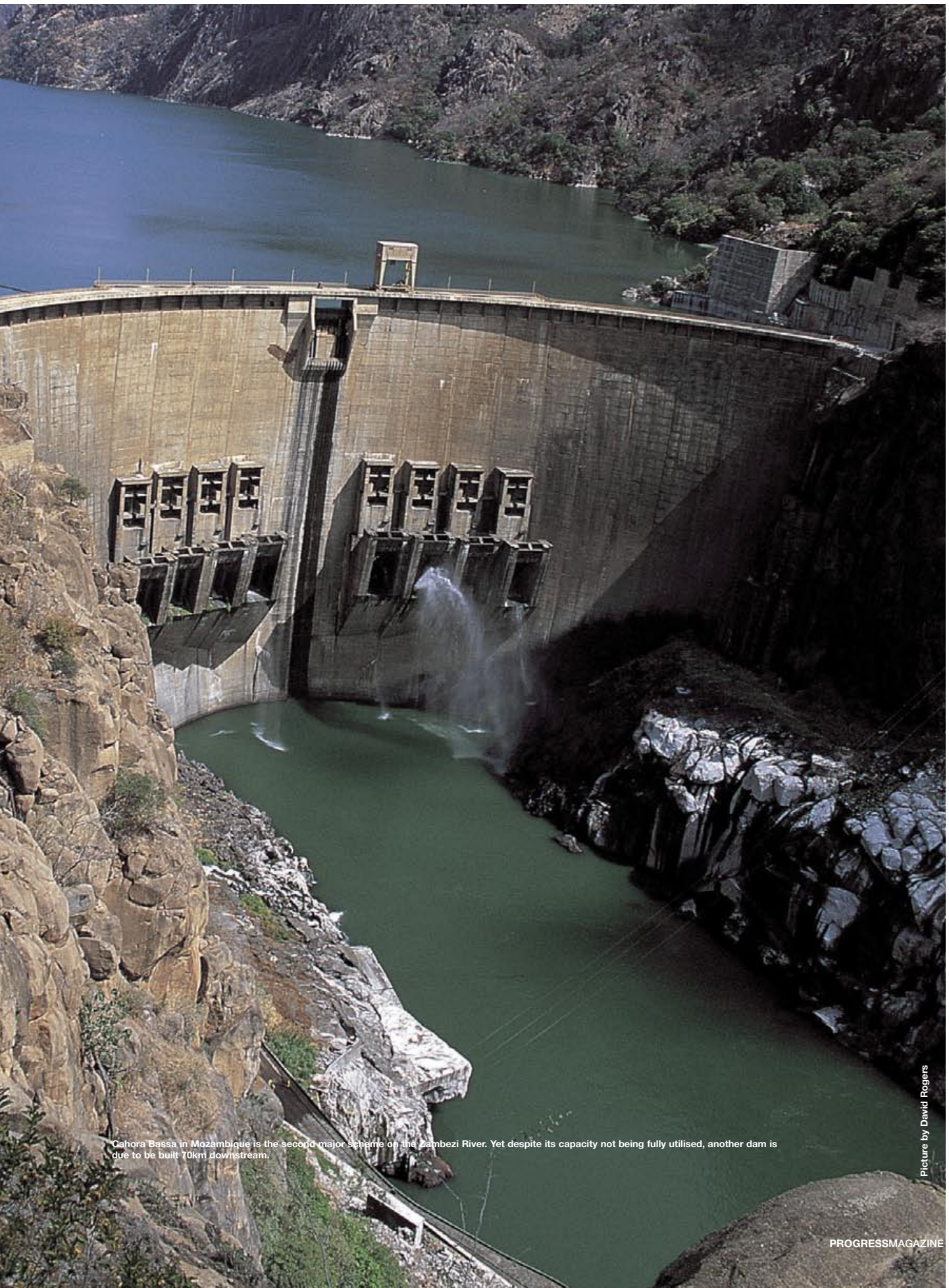
Cahora Bassa in Mozambique is the second major scheme on the Zambezi River. Yet despite its capacity not being fully utilised, another dam is due to be built 70km downstream.